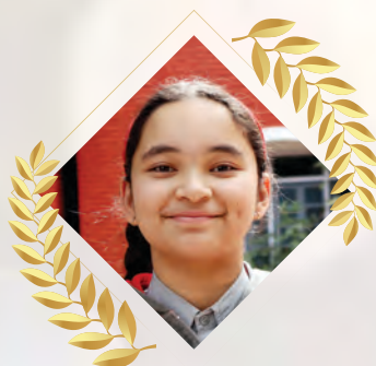
Sinaaki Cynthia Literary Club